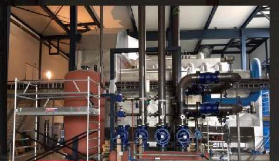
Steam manifold and piping