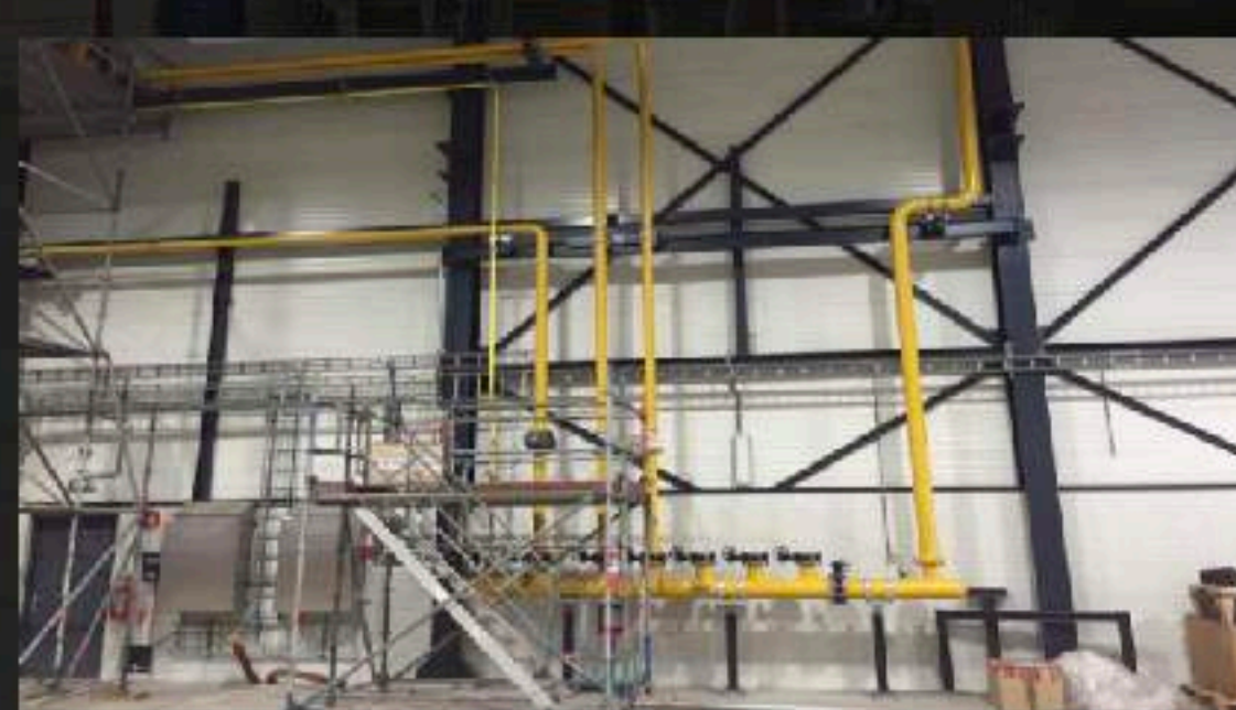
Gas manifold and piping