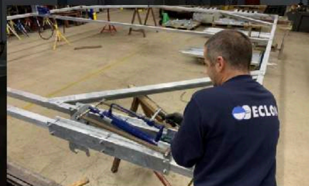
Gas fuel skid assembly