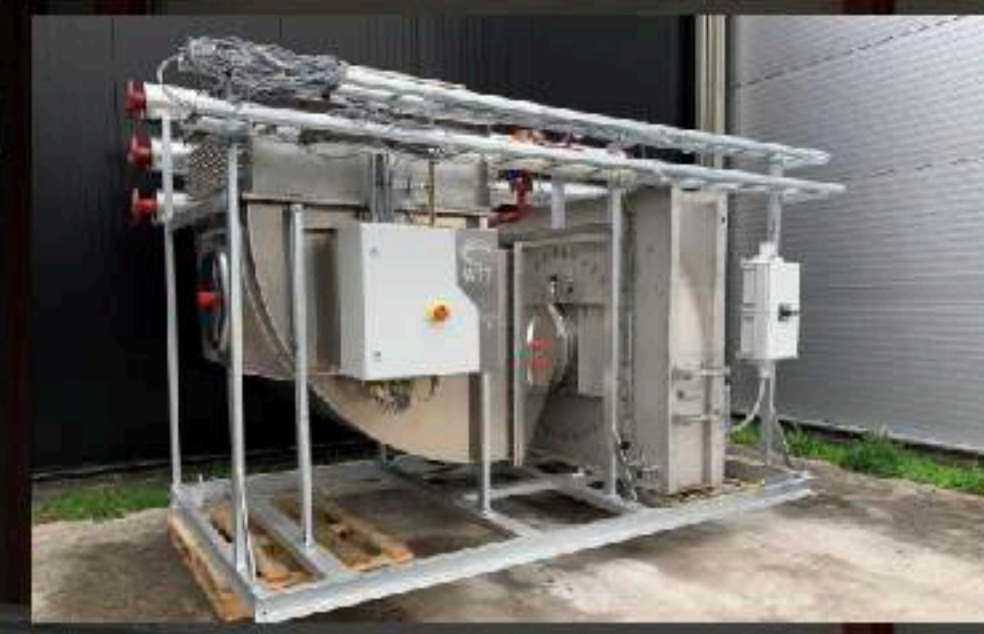
Air skid assembly