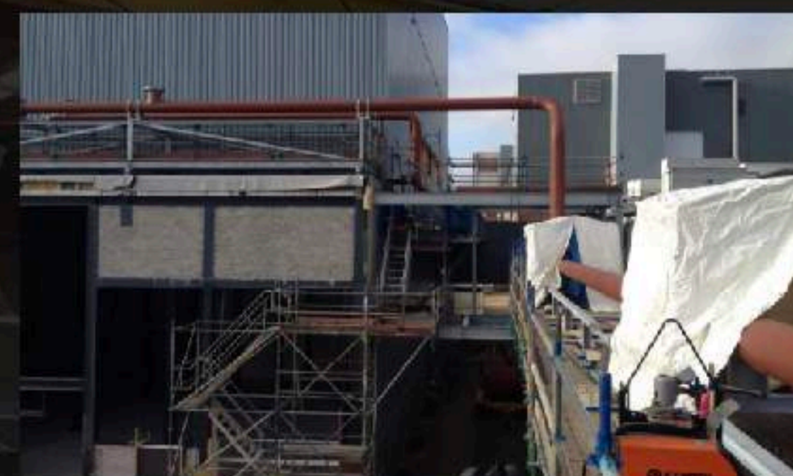
Pipe bridge installation