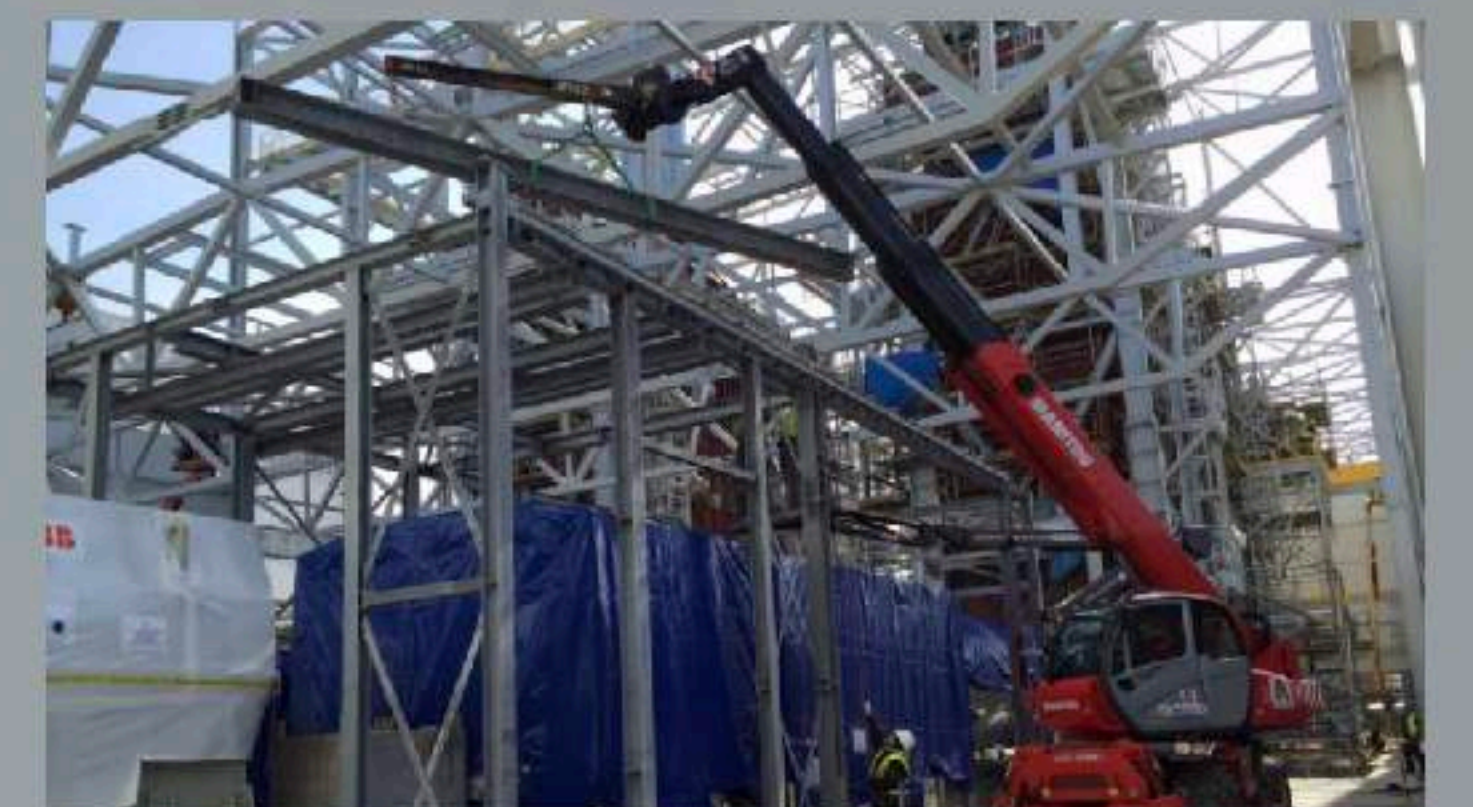
Steel structure and insulation panels