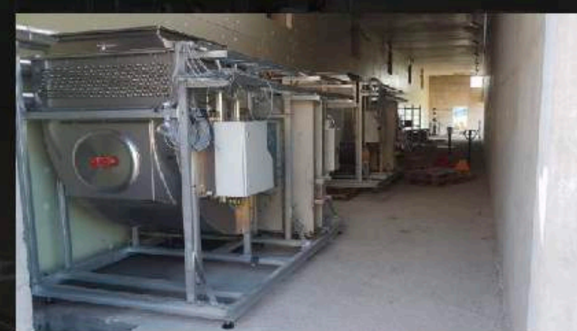
Air skid installation