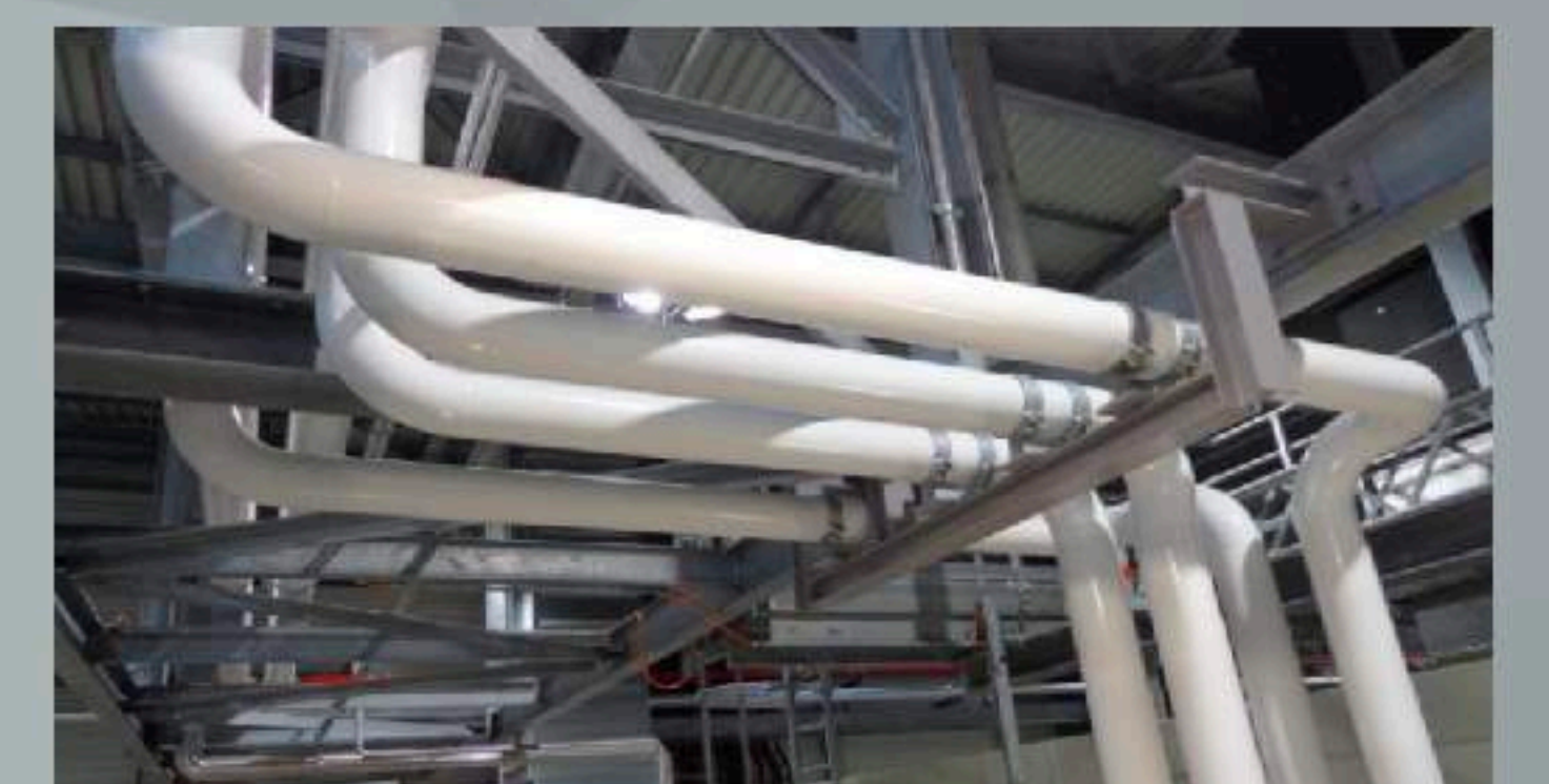
Piping fabrication and installation