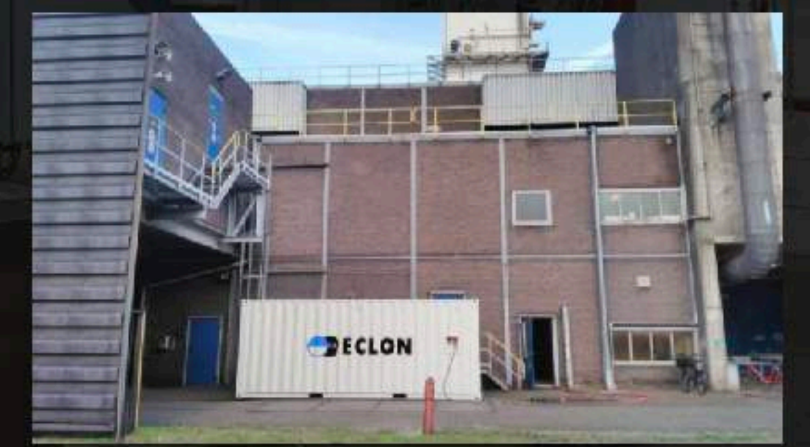
Tool container on-site