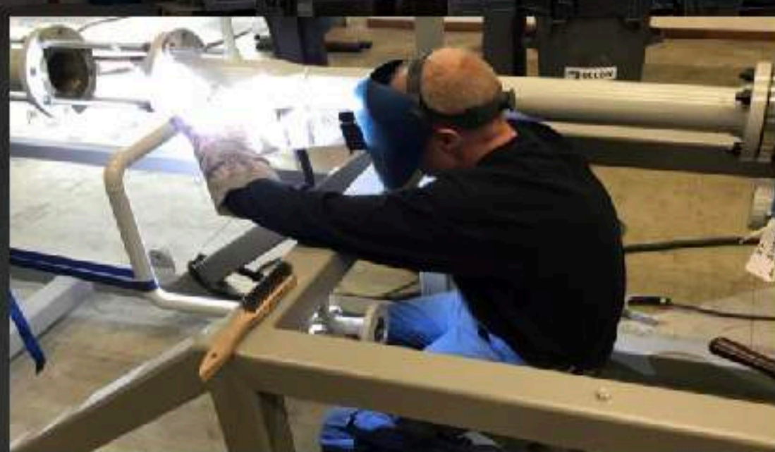
Certified welding EN and ASME